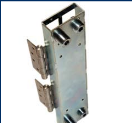
Hinge Chassis System